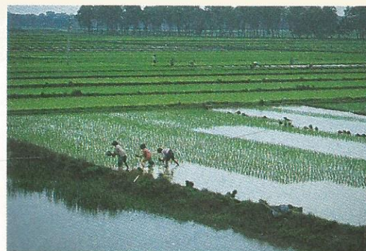
Rice paddies cover eastern lowlands of China.

11. What three resources are found most in western China?